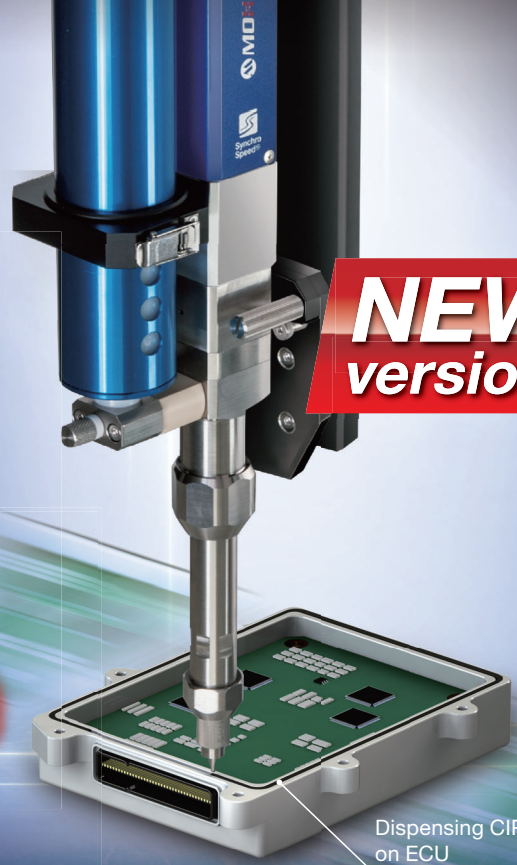
Dispensing CIPG on ECU